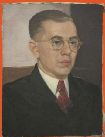
Portrait of Nazi Politician

"YIVO is increasingly using digital technologies and online learning to provide wide-spread public access to the treasures in our collections. The YIVO Cernia Slovin Online Museum will transform the ways audiences of all ages and backgrounds think about and