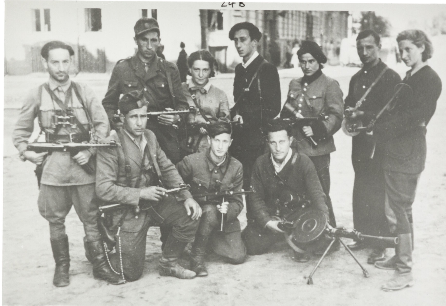
Jewish Lithuanian partisans, July 1944.

resistance groups, stories of the activities of the underground networks that rescued Jews, and the accounts of those who resisted the Nazis by going into hiding in German-occupied Europe.