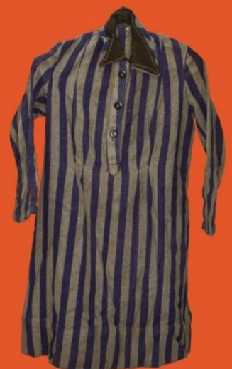
Concentration Camp Uniforms